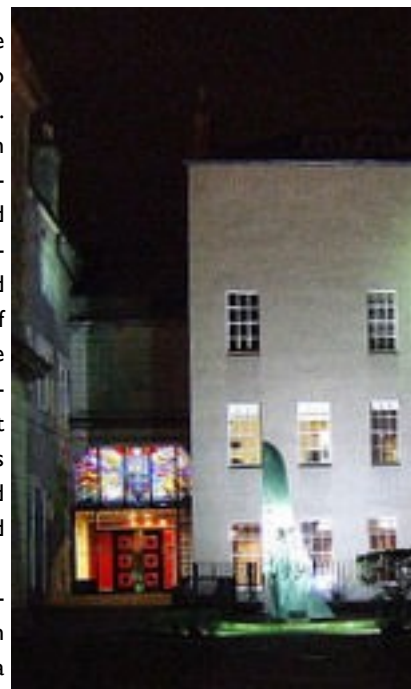
Surgeons' Hall by night